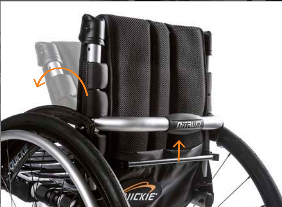
Release Bar (standard)